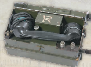
Military field telephone, c. 1950s - 1960s

Take a look at a re-creation of Singapore's first Police Radio Branch at Pearl's Hill and explore the radio equipment that helped improve police response time and effectiveness.