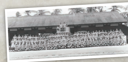
Police Reserve Unit, 1952

These turbulent years were marked by some of the worst riots and gang crimes in Singapore's history. Learn about the tactics and equipment used by the police to maintain public order.