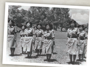
The first batch of policewomen in 1949

Following the Japanese surrender, the police force was impoverished and suffered from low morale, while Singapore struggled with rising crime. Learn how the police force was rebuilt and reorganised during these difficult post-war years.