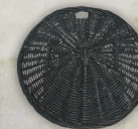
Wicker shield, c. 1950s