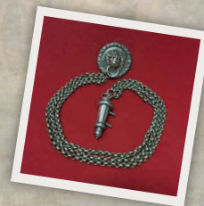
20th century Straits Settlements Police Force whistle and chain

The first hundred years were challenging for our nascent police force. Find out how the young Force coped with the scourge of gambling, secret society riots and communist-motivated crimes.