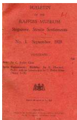
Raffles Bulletin 1928-2005 pdf of all papers