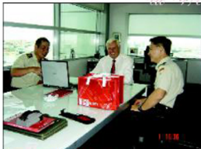
"Sharing with our partner what NDP 2006 is all about"