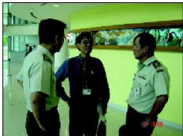
"I will try my best"

"Strike while the iron is still hot". This perhaps best describes how the Sponsorship Committee has been working relentlessly with our partners after the Sponsorship Launch in Oct 2005. The pause arising from a major training exercise and the year-end festivities did not dampen the fighting (or marketing) spirit of the Marketing Directors.