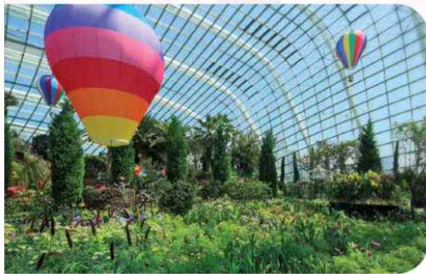
Flight of Fancy