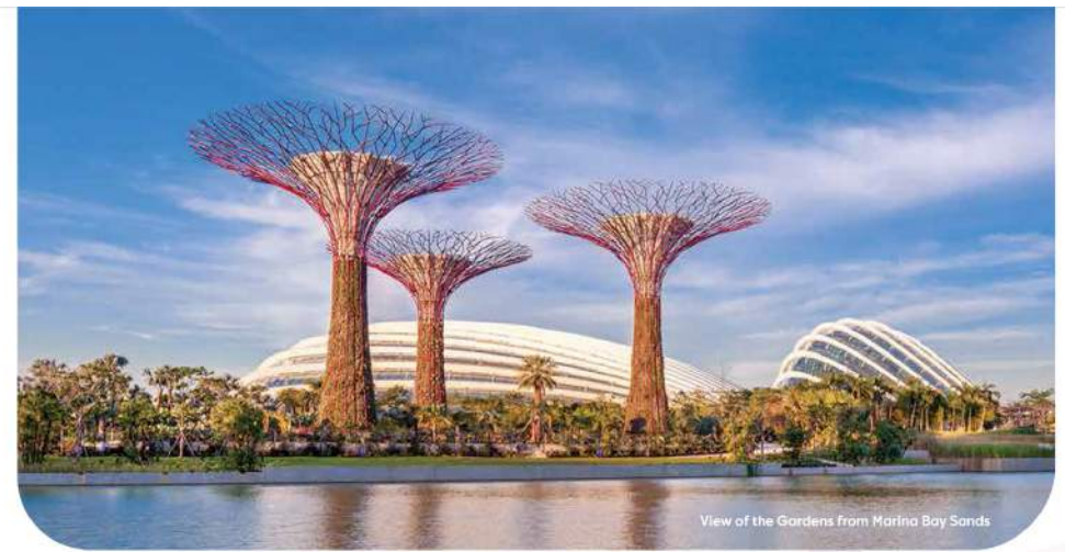
View of the Gardens from Marina Bay Sands