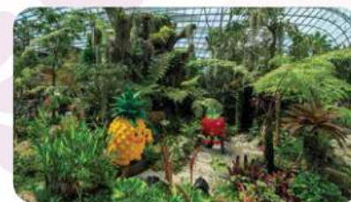
Christmas Sugar Mountain