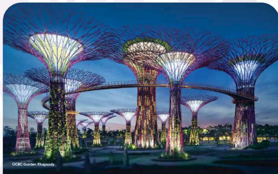
OCBC Garden Rhapsody