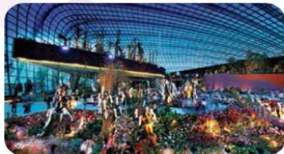
Flower Field Nightscape

Stop and smell the flowers in the colourful changing displays of the Flower Field, which reflects different seasons, festivals and themes.