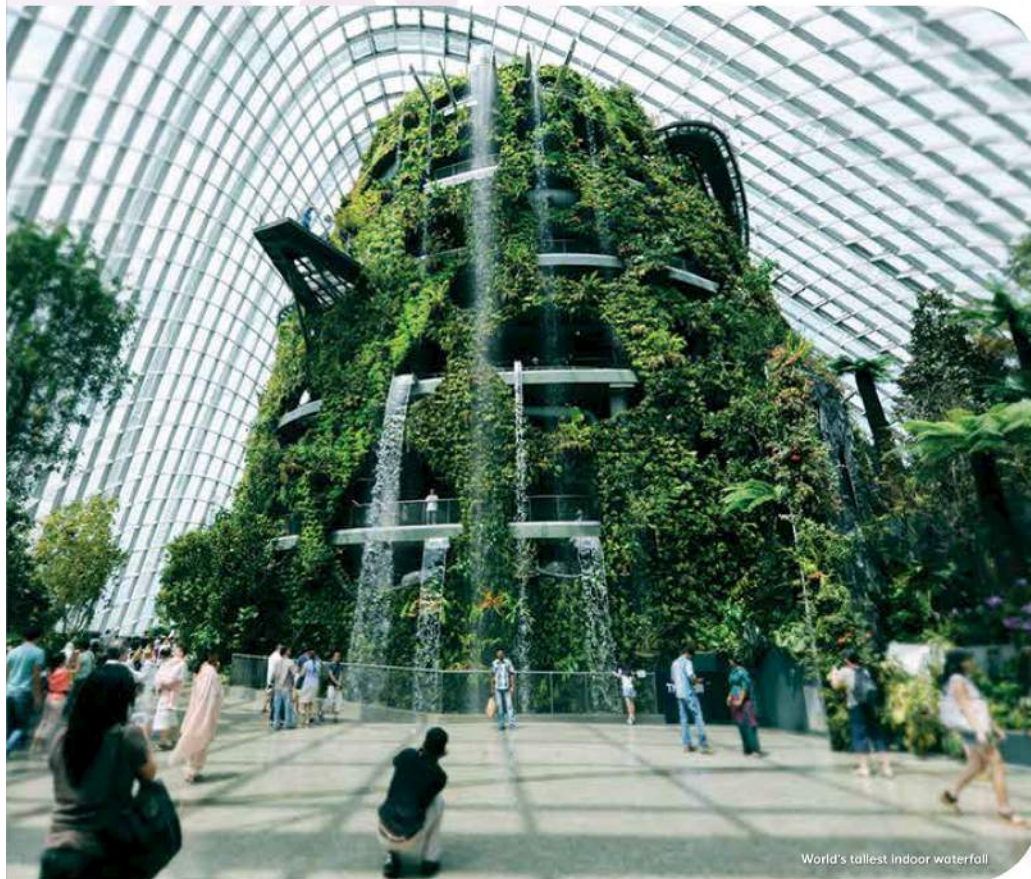
World's tallest indoor waterfall