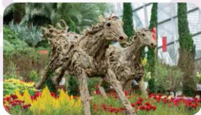
Year of the Horse