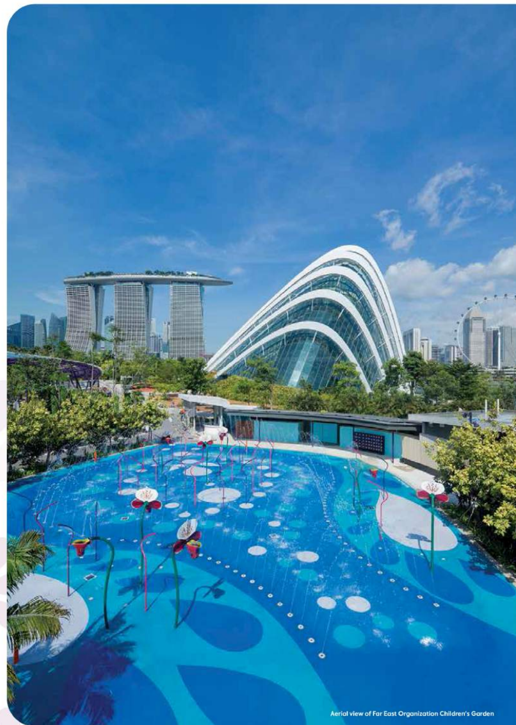
Aerial view of Far East Organization Children's Garden

Discover the world of plants from the Treehouses and test your skills at crossing our suspended bridge.