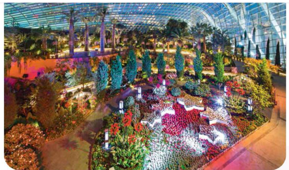
National Day and Hari Raya