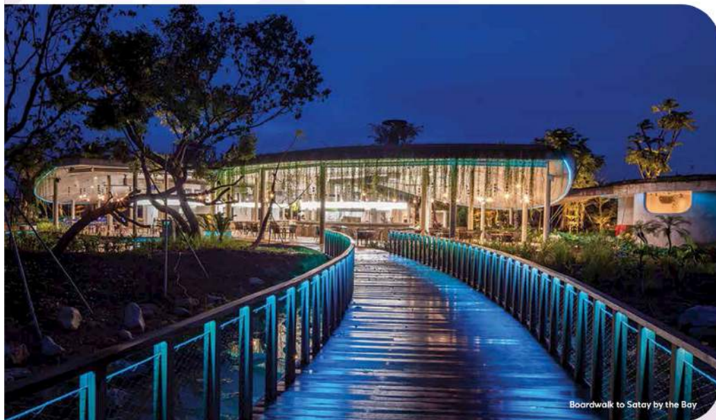
Boardwalk to Satay by the Bay

You're never more than a few steps away from great food at the Gardens. Savour gourmet dining as well as authentic local fare at our restaurants.