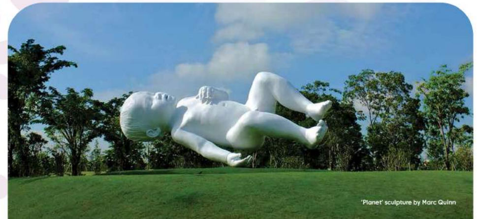
'Planet' sculpture by Marc Quinn