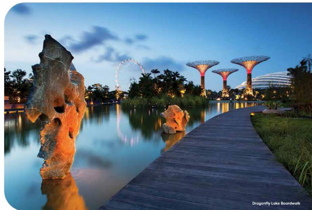
Dragonfly Lake Boardwalk