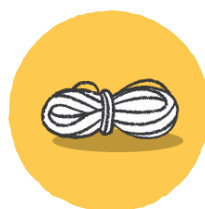
Yellow medium-weight yarn (1 yd)