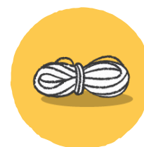
Black medium-weight yarn (1 yd)