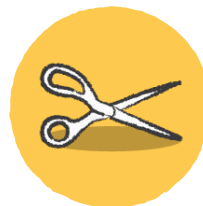
Scissors (not included)