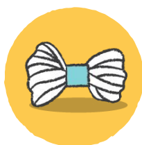
White medium-weight yarn (3 yds)