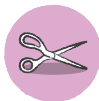
Scissors (not included)