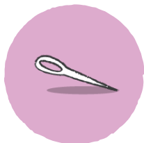
Tapestry needle (not included)