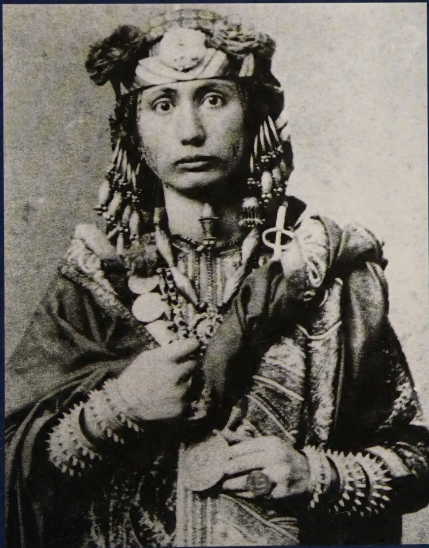
Emily Ruete, Princess Salme of Zanzibar and Oman