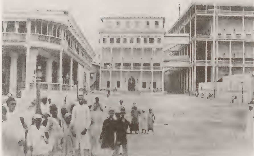
Beit al-Hukm built by Seyyid Madjid in the centre. The building to the left is Beit al Sahel. The Old Palace, which was refurbished by Sultan Bargasch, who also built Beit al Ajaib on the right.