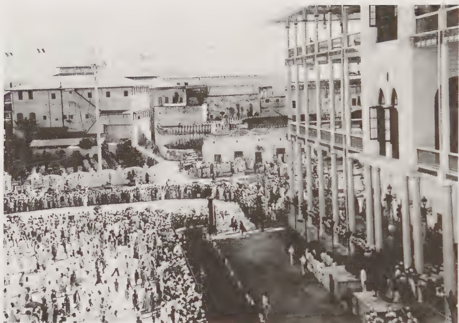
A royal gathering in House of Wonders (Beit al Ajaib)