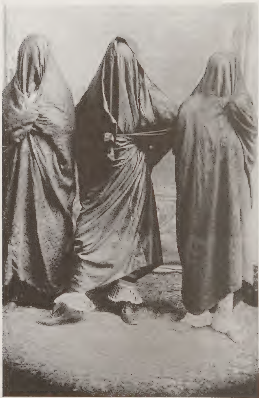
Omani Arab women in complete purdah (veil)