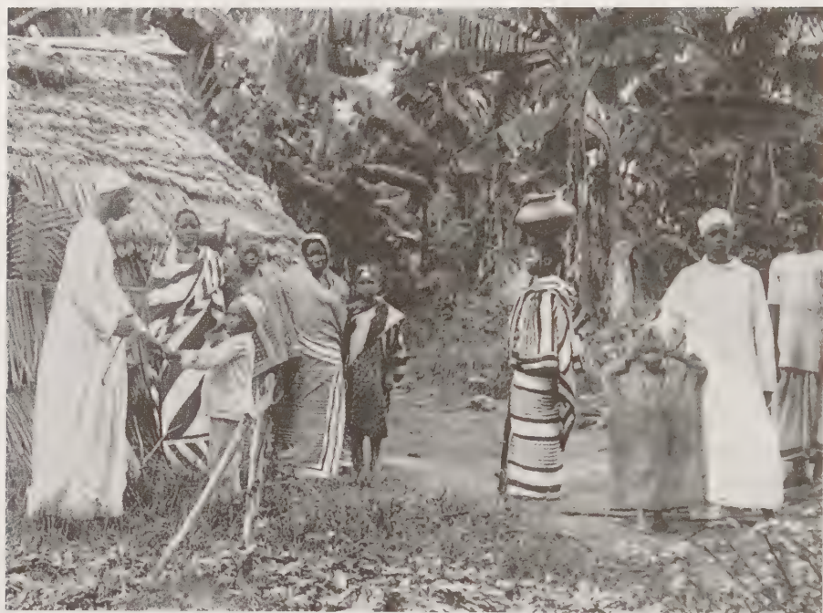
A typical view of a settlement in the plantation with banana and coconut trees.