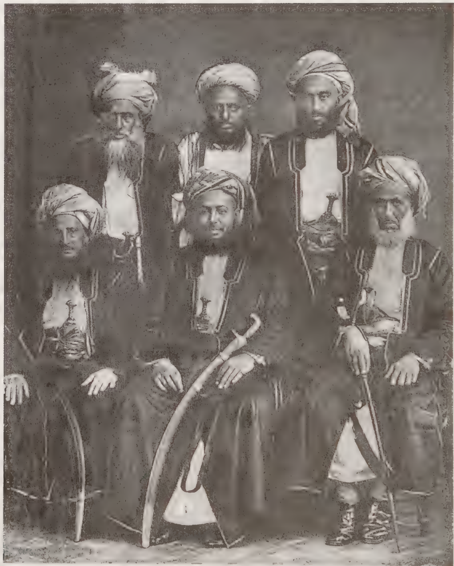
The Sultan of Zanzibar, Seyyid Barghach with his advisers in England in 1875