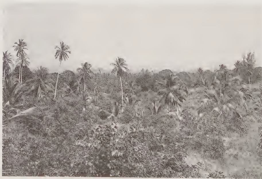
Mango and coconut plantation