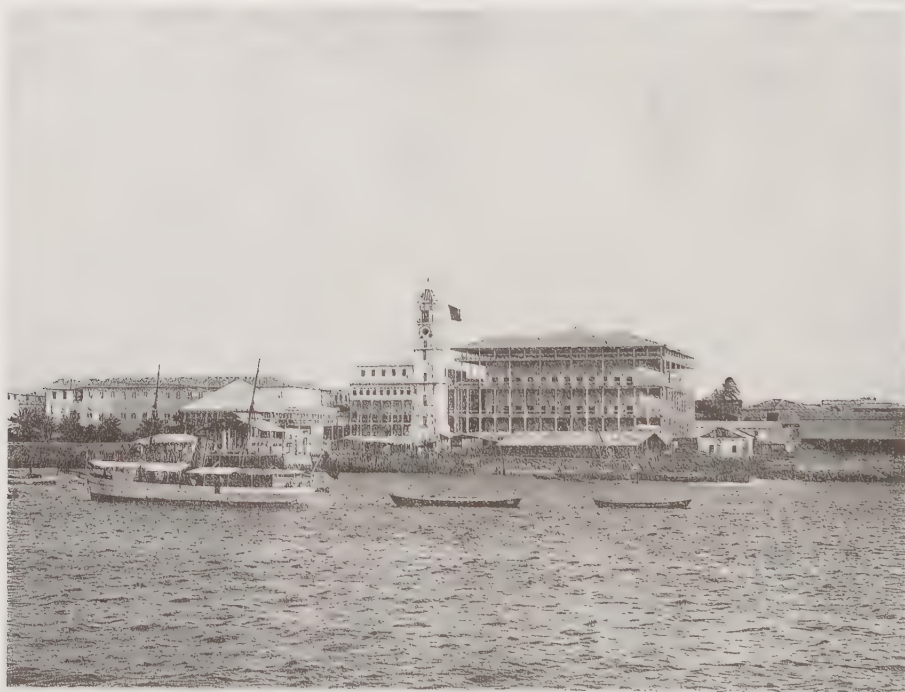
Zanzibar coast with Beit al Ajaib in the centre.