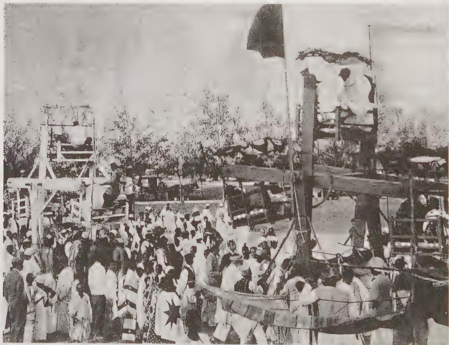
Locals enjoying a festival