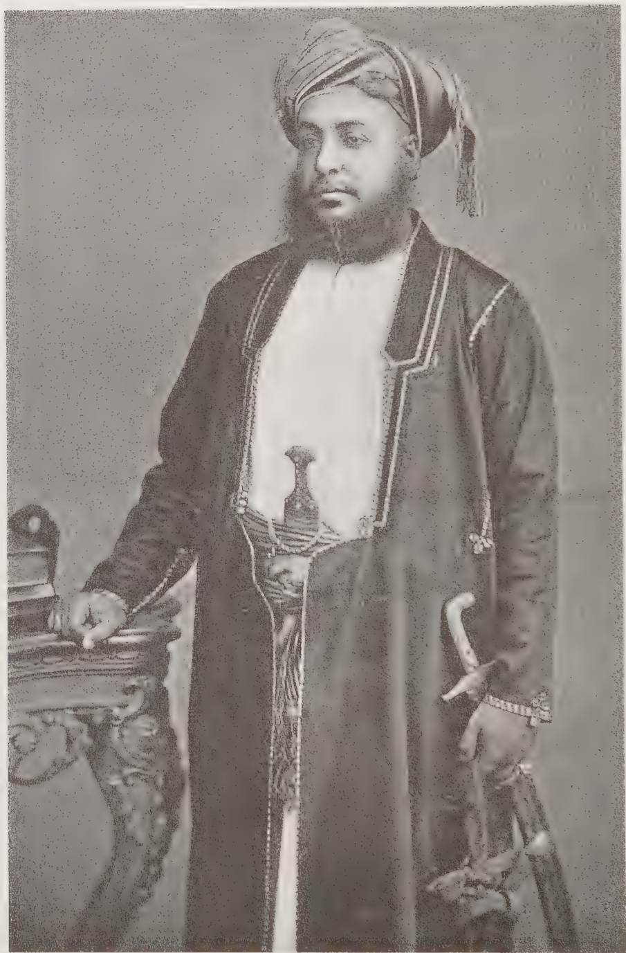
Seyyid Bargasch Bin Said, brother of Princess Salme.