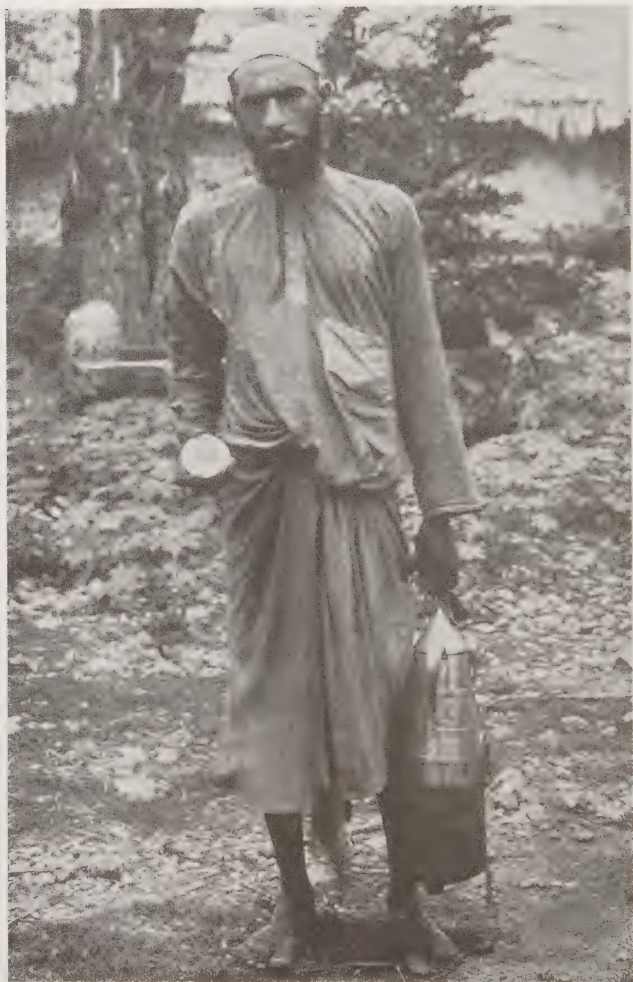
Native Coffee Seller.