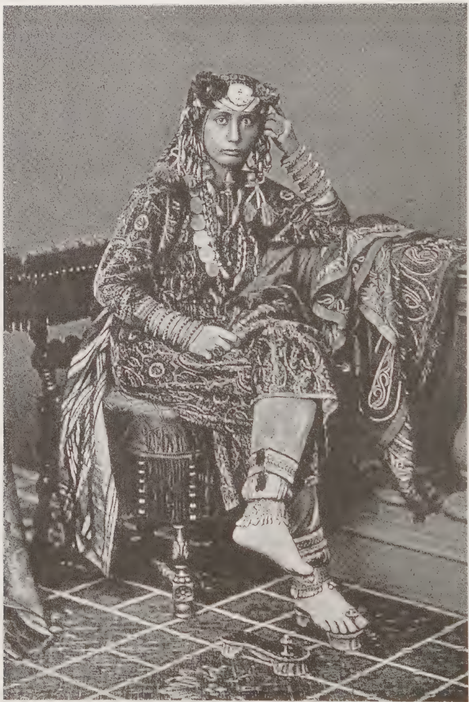
Princess Salme in traditional costume and jewellery.