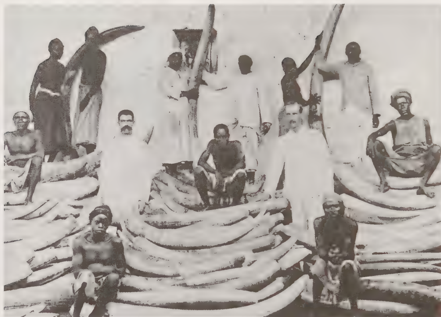
Ivory tusks for auction.