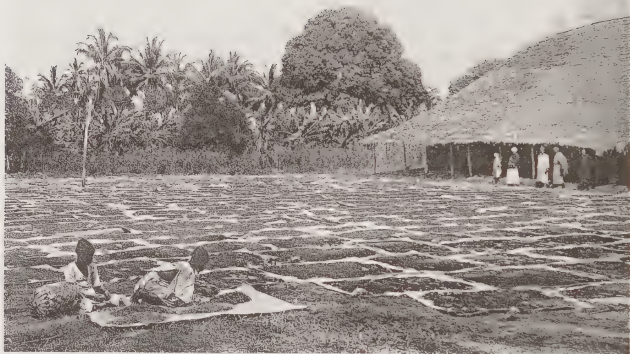
Slaves spreading out cloves on a plantation