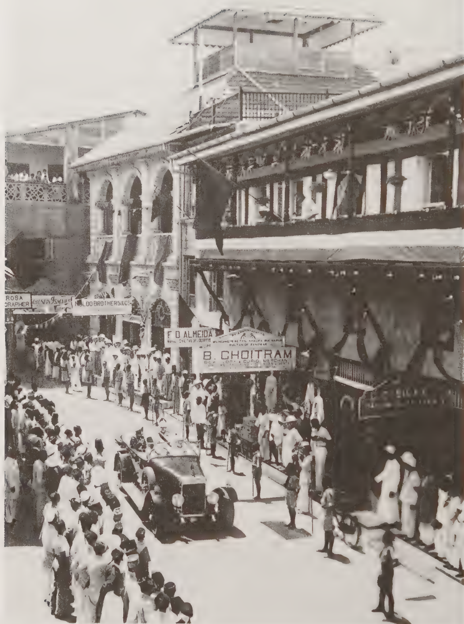
The main shops near the post office before the revolution. The street was decorated and lined with people to greet the Sultan, Seyyid Khalifa bin Haroub, on his silver jubilee in 1936.