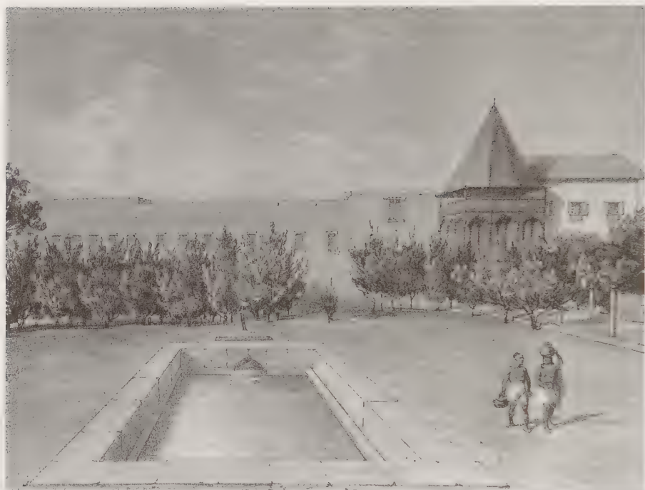
(Top and below) Princess Salme house in Mtoni