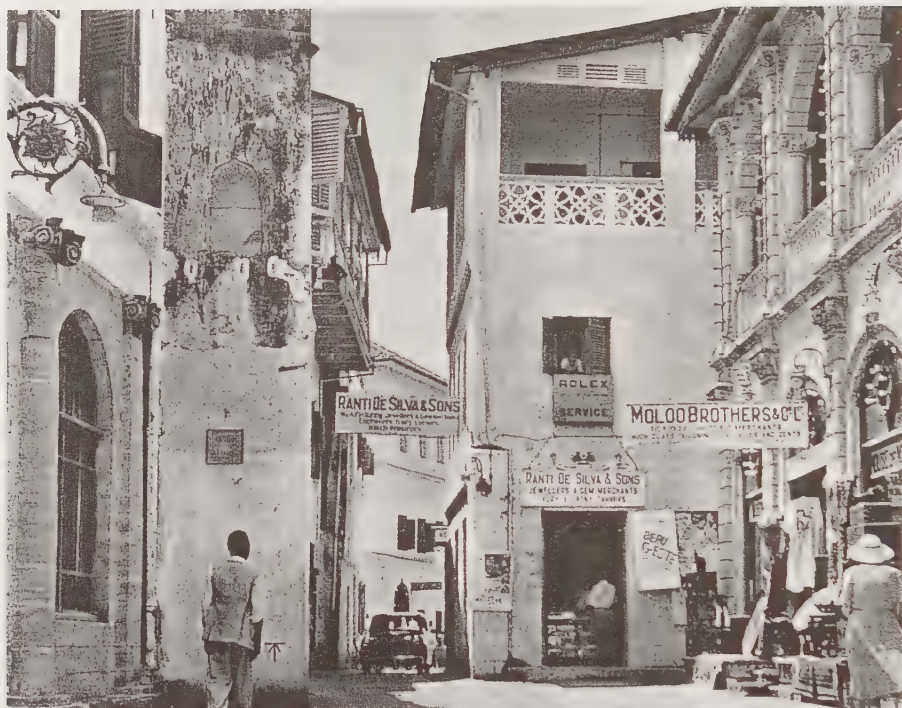
Top and bottom: Street scene near Shangani post office (now called Kenyatta Road) before the revolution,