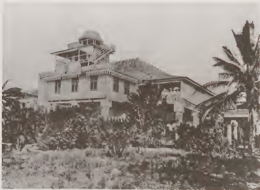
The Marhubi Palace was built by Sultan Bargasch in the 1880's.