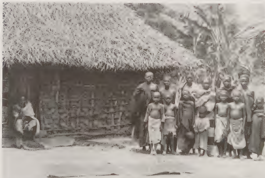
A thatch roof in a village with woman and children