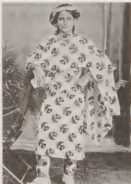
Swahili and Arab women in traditional clothes