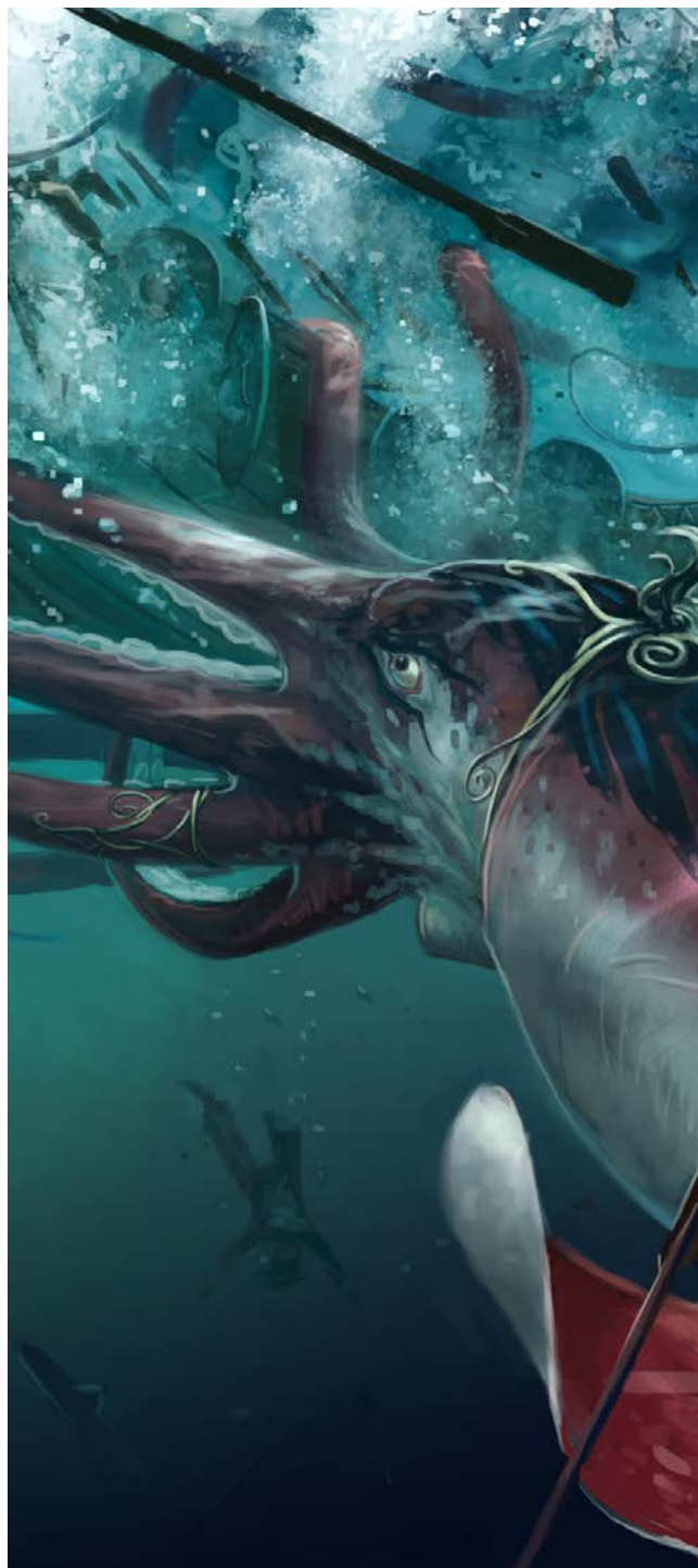
Illustration by Ben Wootten