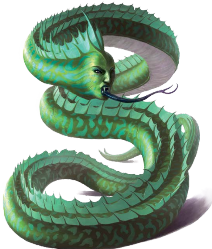
Illustration by Nicholas Cloister

CHOOSE ANY CLASS 2 OR LOWER SHIP AS YOUR SHIP.