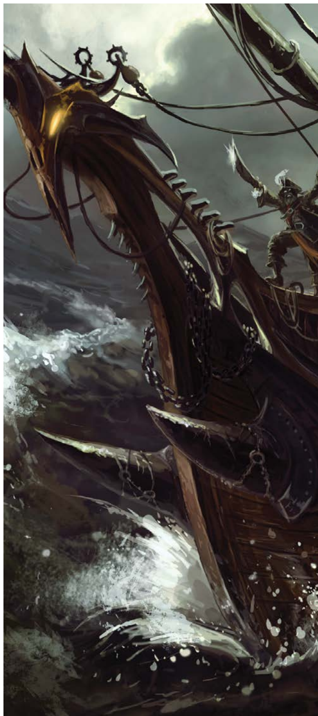
Illustration by Mariusz Gandzel