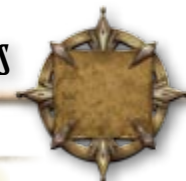
TABLE 5-4: NEW SKILLS