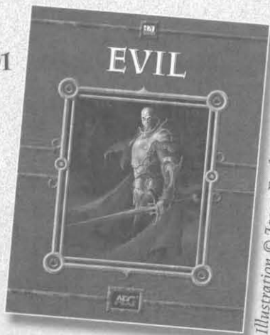
Illustration © Jason Engle

Who said you had to play the good guys? Being evil just got easier. This d20 system sourcebook has everything you need to run evil characters, develop evil campaigns, and make your nasty NPCs just a little bit nastier. Evil has rules for new prestige classes, new spells, new clerical domains, and demon summoning. If you're playing good after this book is out, you're on the wrong side of the game. 128 Pages, soft cover.