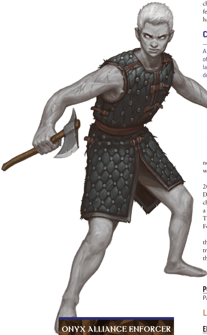
ONYX ALLIANCE ENFORCER