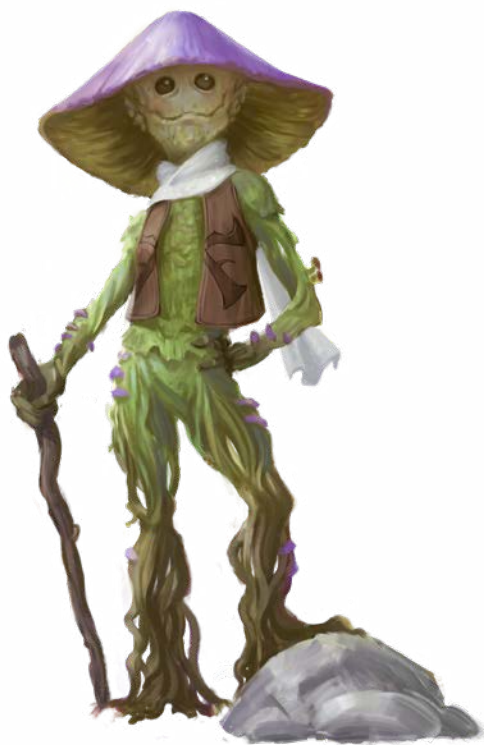
RAIN IN CLOUDY DAY