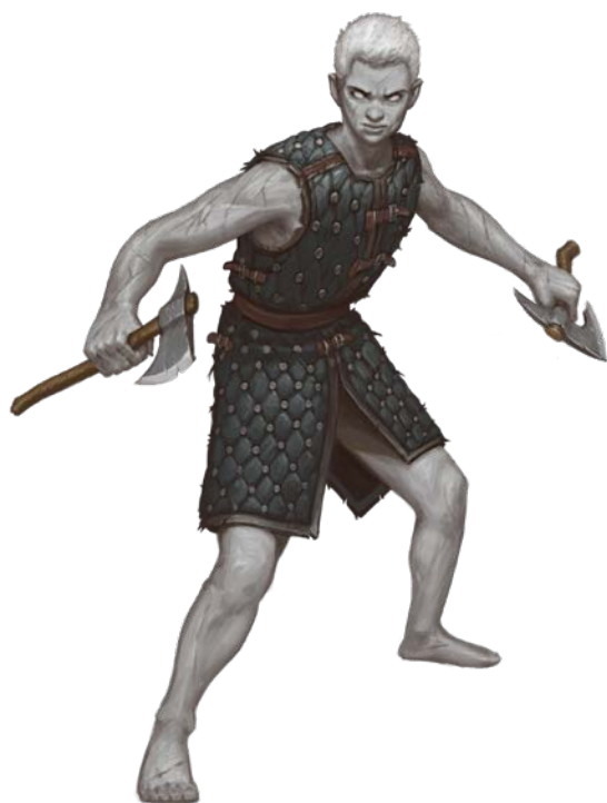
ONYX ALLIANCE ENFORCER