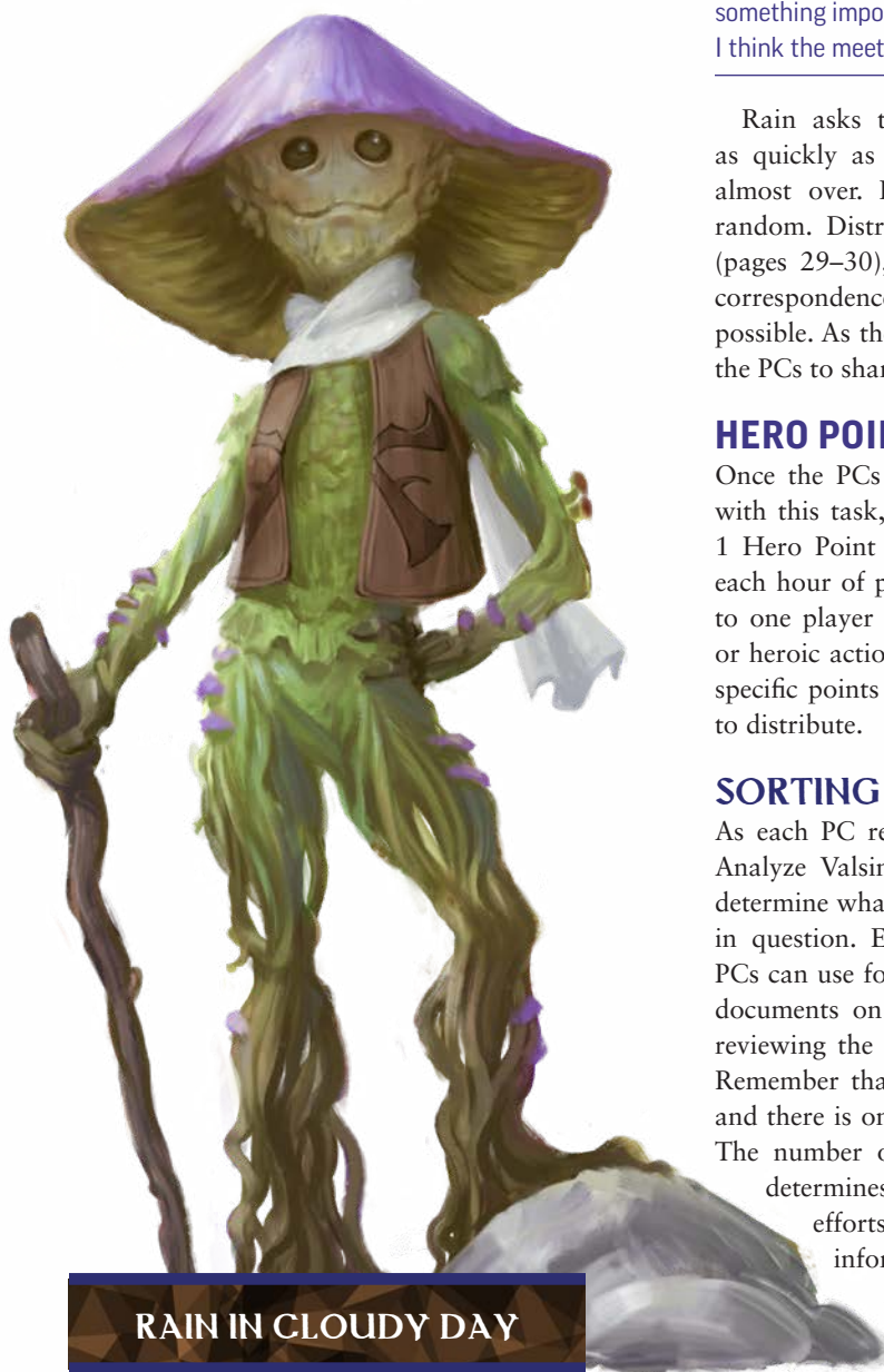
RAIN IN CLOUDY DAY

As each PC reads over a document, they can use the Analyze Valsin's Correspondence activity (page 5) to determine what they recall about the lodges and regions in question. Each handout indicates which skills the PCs can use for that document. The PCs may exchange documents on a one-for-one basis, if they wish, after reviewing the contents but before rolling their checks. Remember that these checks should be rolled secretly, and there is only time for a single check per document. The number of Correspondence Points the PCs earn determines the rewards Rain gives them for their efforts. The basic, advanced, and inaccurate information the PCs might recall using the Analyze Valsin's Correspondence activity is detailed for each handout on the following pages.