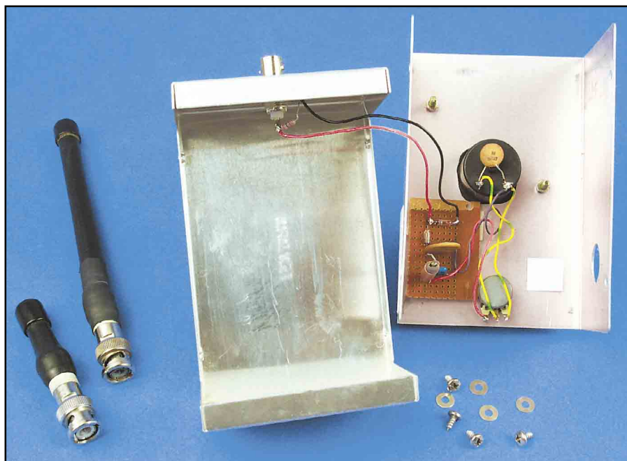
Figure 3—The case, circuit board and antennas for the field strength meter.