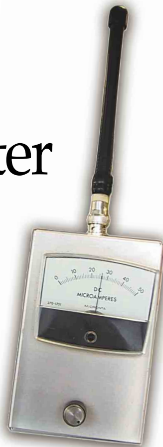
The RF Signal Strength meter responding to my Kenwood TH-26AT transmitting on 147.900 MHz with 1 W, 2 feet away from the meter. The sensitivity control is set at mid range.

The “No Fibbin” field strength meter can be made using parts that many hams already have around the shack. The best results will be obtained using germanium or Schottky small signal diodes, a metal enclosure and an analog meter movement (which has a low full-scale deflection current). The other component values are not critical; close is good enough. All the parts can be mounted on a small pre-punched PC board or they can be wired point-to-point without a PC board. In either case, keep the component leads as short as pos-